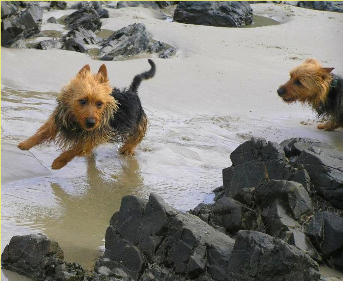
Biscuit (left) Teddy (right)

"But the love of adventure was in father's blood."