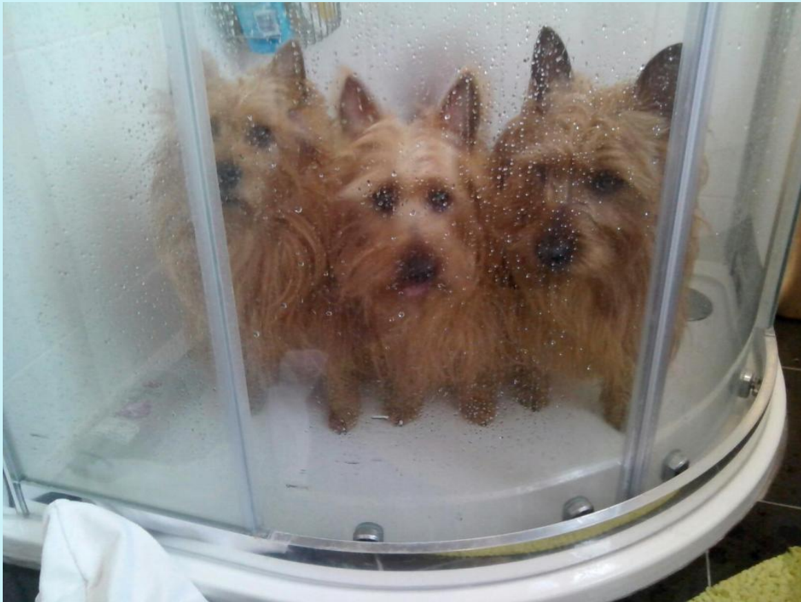
Tootsie, Alfie and Misty