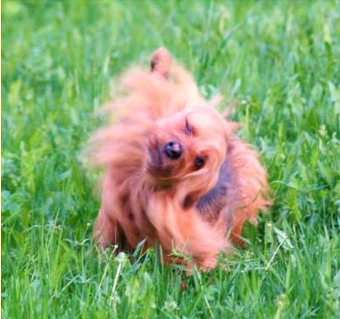
Twee-Dle-Dee Unshaved Dave