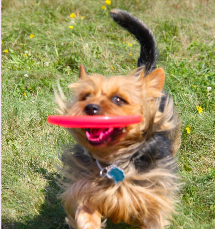
GCH Aristas Rocky Mountain High