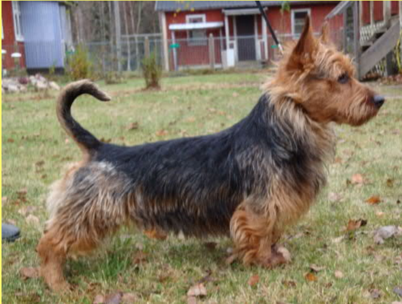
"Bobo" Twee-Dle-Dee Thru The Looking Glass