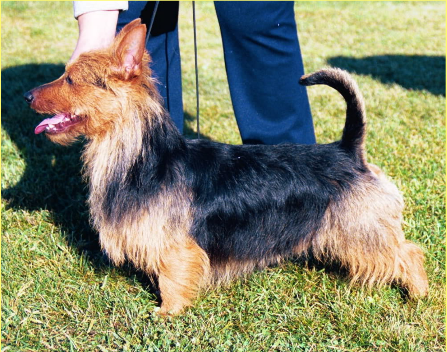
Ch Twee-Dle-Dee Join The Circus

If you mean best show dogs I have bred, those who are closest to my ideal Aussie, I would mention the male Ch Twee-Dle-Dee Join the Circus. He was a handsome boy, well built with a lot of style and reach of neck, dark colours, and he moved very well. In bitches Ch Twee-Dle-Dee Take All Of Me was a very pretty bitch with a very good front and unusually good neck and carriage for that time. Today I have her great grand-daughter Ch Twee-Dle-Dee Without Makeup, who not only is a successful show dog, but also a fantastic brood bitch, who whelps her big litters without problems and who is the best possible mom to her puppies.