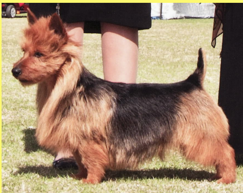
Photography by Kit 2 GCH CH Kambara's Zebulon "Zeb"