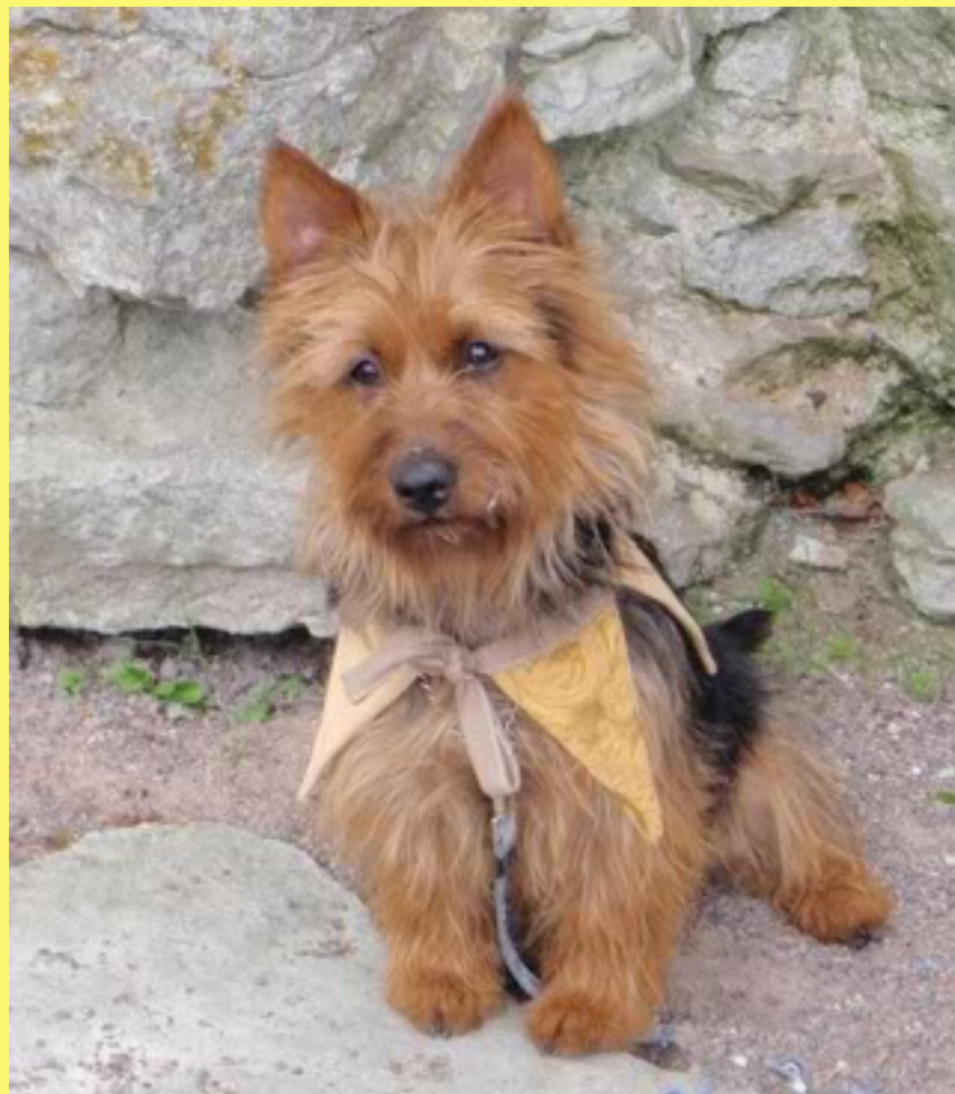
Xita Av Falchebo Owner: Ulla-Britt Norgren