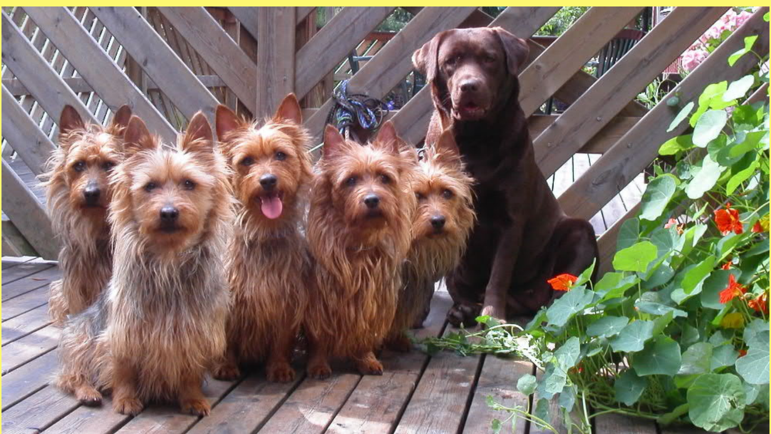
From the left: Ch Tatong's Spy In The Sky, Ch Tatong's Heavenly, Ch Twee-Dle-Dee Without Makeup, Ch Twee-Dle-Dee Laughing Face and Twee-Dle-Dee Dark Angel.