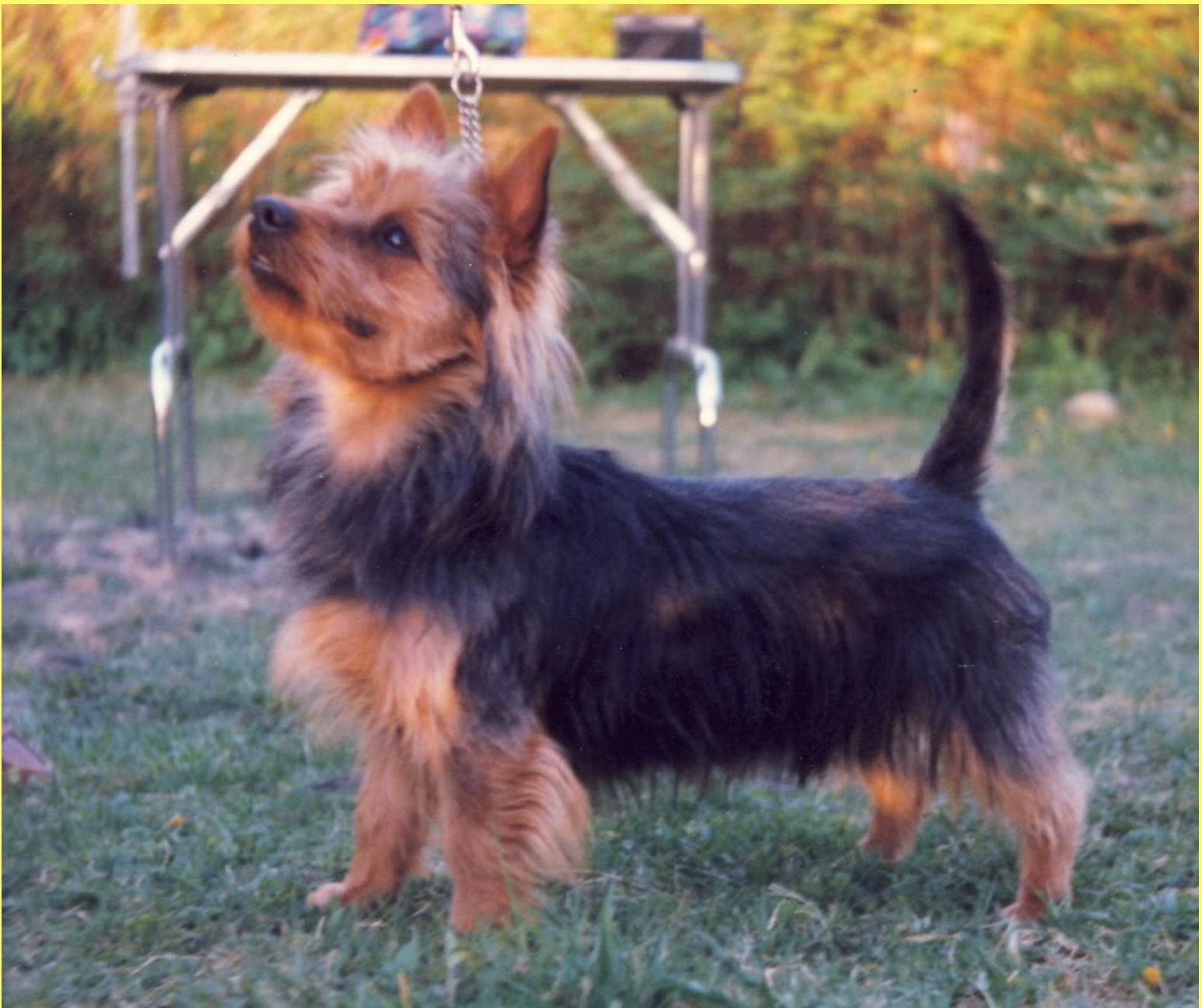
BISS Ch. Twee-Dle-Dee Knockout Drops

That is difficult. There have been so many proud moments through the years, but one memorable moment was when the blue/tan male Ch Twee-Dle-Dee Knockout Drops won BIS at our National for the fourth year in a row. He won 1991 to 1994 and was the most winning Aussie in the Swedish rings at the time.