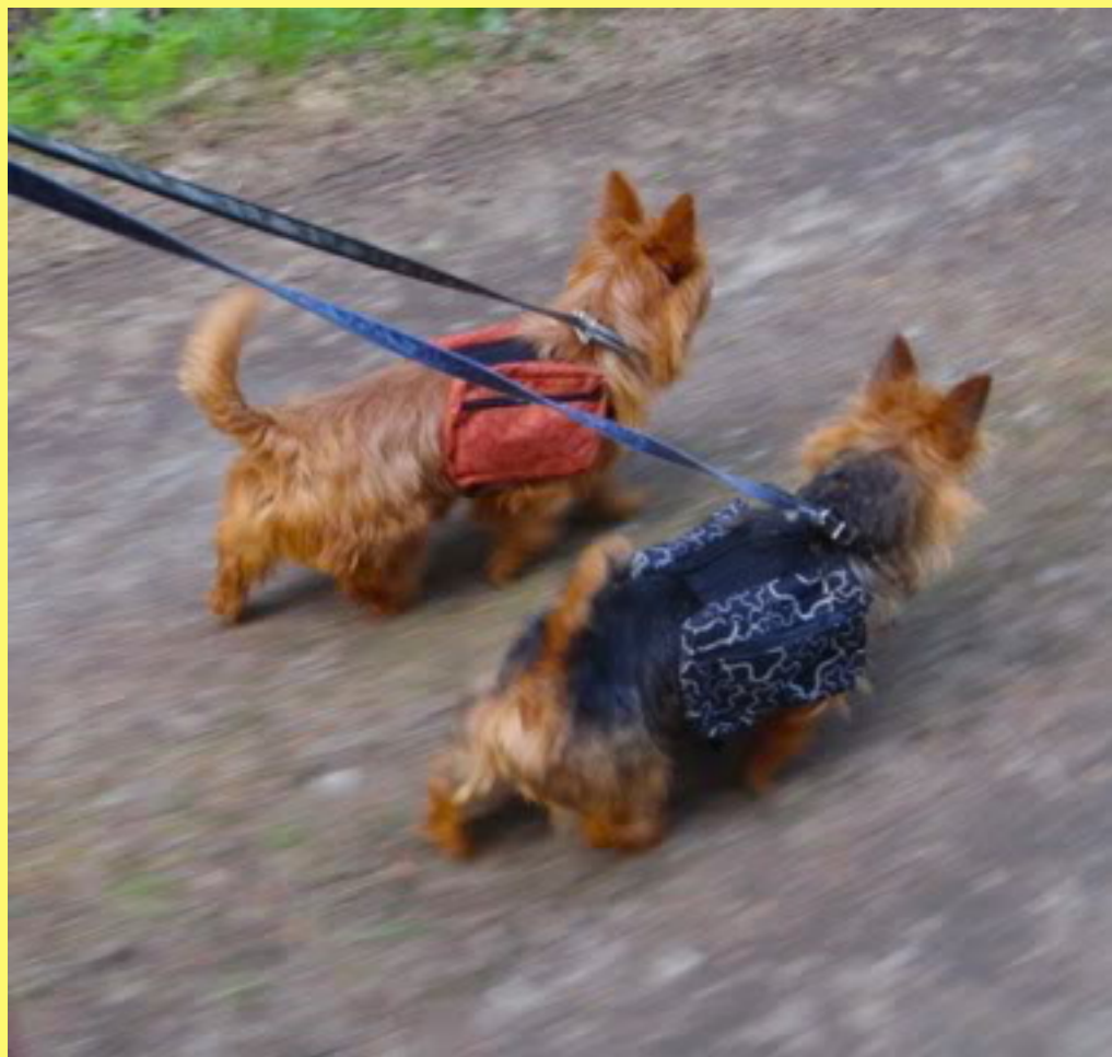
Vitterklippens Myran and Vitterklippens Lindy-Sue