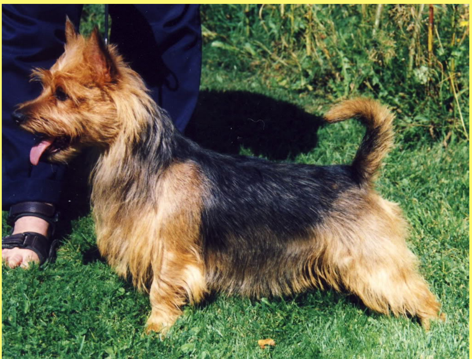
Ch. Twee-Dle Dee Take All of Me