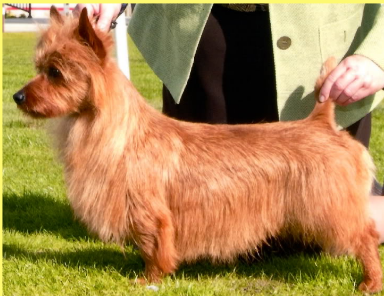
1 GCH CH Ryba's Nothing But Blue Skies "Indy"