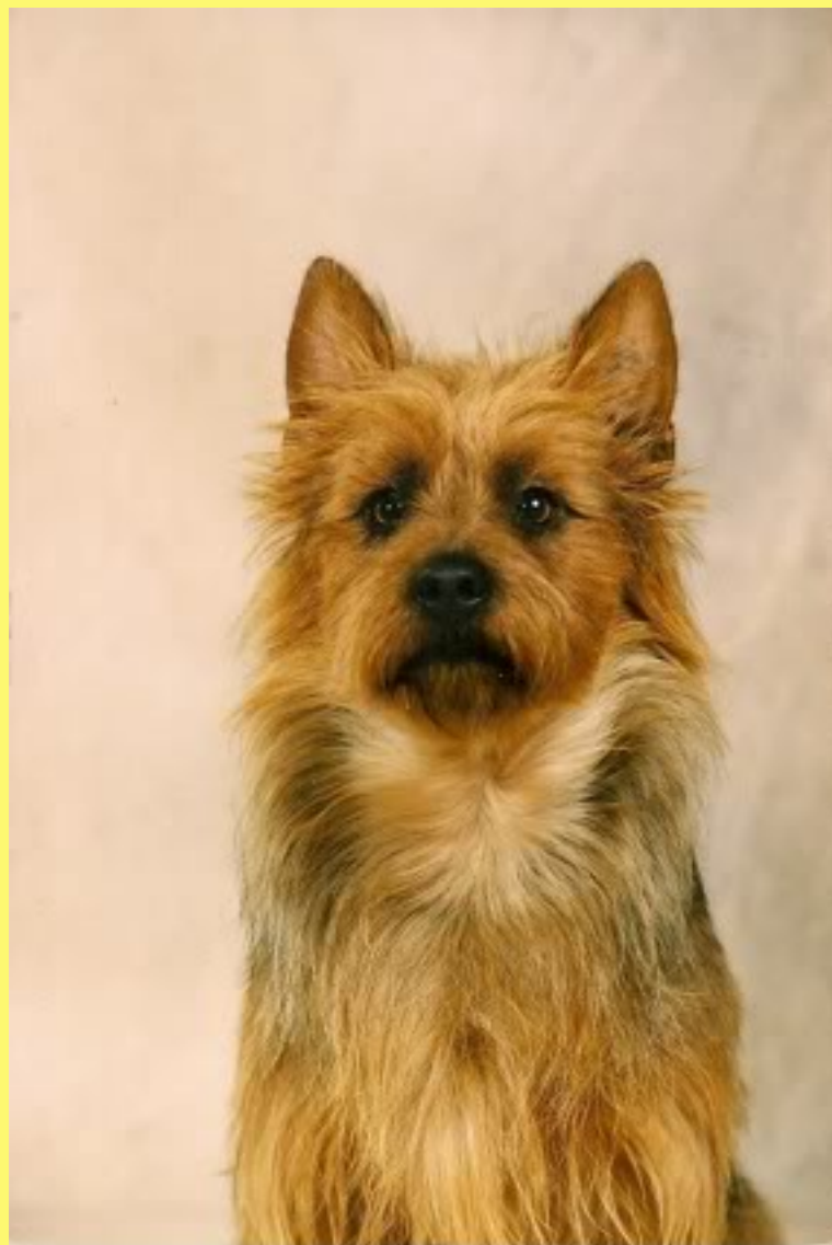
Baccus = SE UCH, SE V-03 Vitterklippens baccus (NORD UCH Övikspojken Av Falchebo /Vitterklippens Wissla)