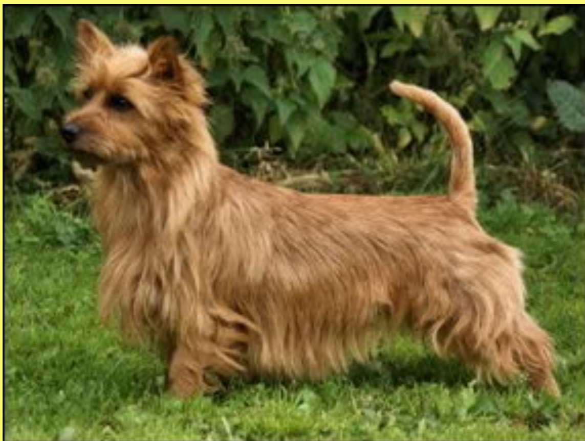
NORD UCH Ålhammarens Ruffa Koppartroll