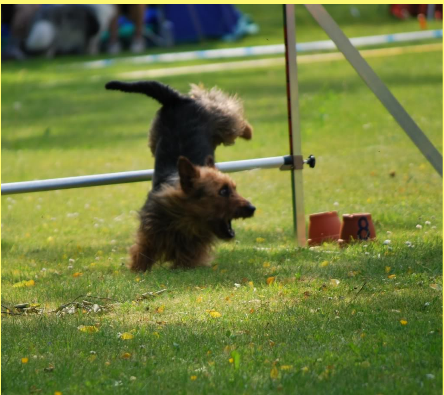
"Tiger" demonstrating his flexibility.

Agility can also be competed in teams with 3-4 dogs. In a team one handler cannot have more than 2 dogs.