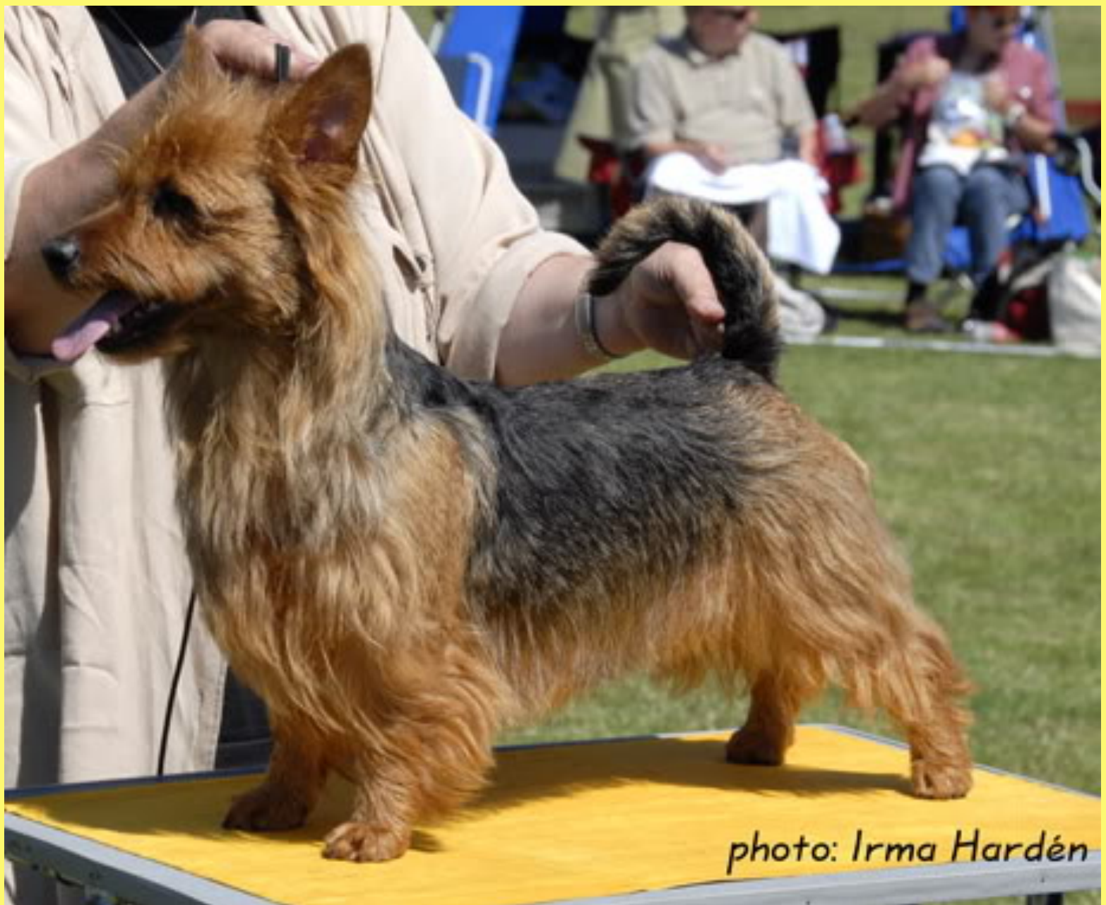
Ch Twee-Dle-Dee Without Makeup

How has the Aussie changed since you started breeding?