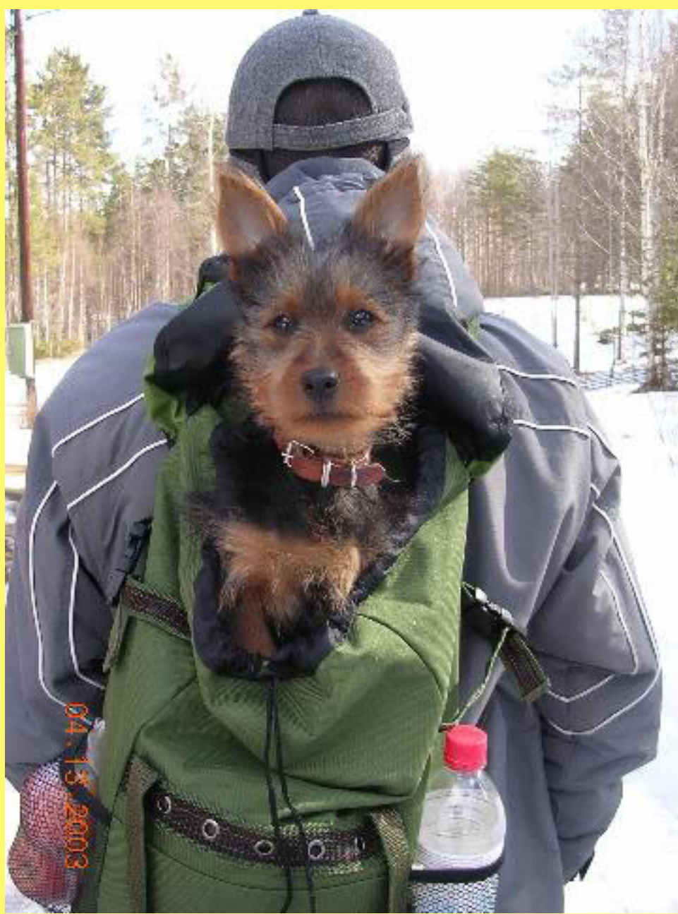
Vitterklippens Blondie Owner: Kennel Stebas