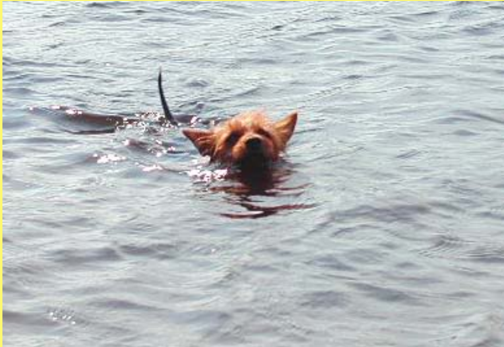
"Nokia" Twee-Die-Dee Connecting People Owner: Ulla-Britt Norgren and Vitterklippens Loke