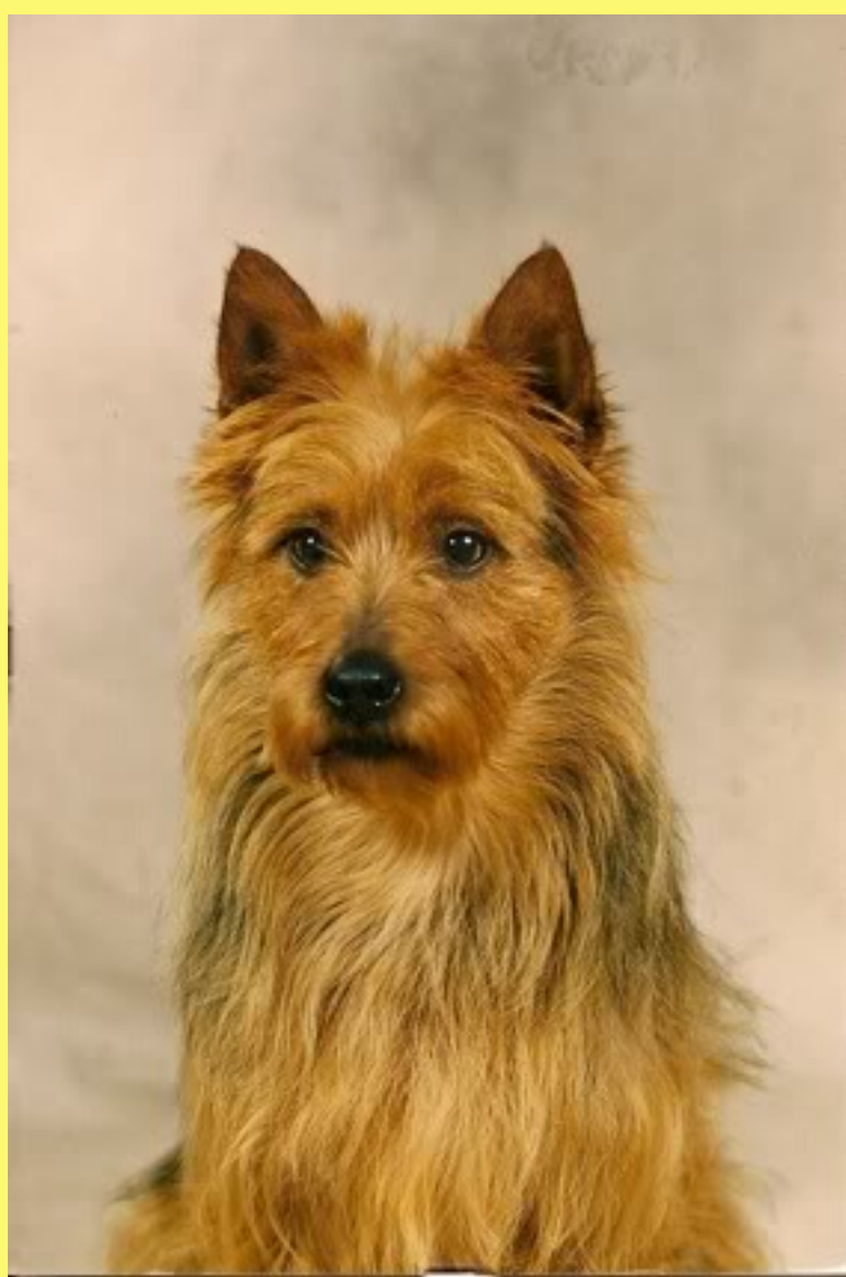
Kille = NORD UCH Övikspojken Av Falchebo (NEJ UCH SE UCH Vargtass Av Falchebo /NORD UCH Tinee Town Thequeenoharts) Owner: Vitterklippens kennel Breeder: Marthe Falch Norway