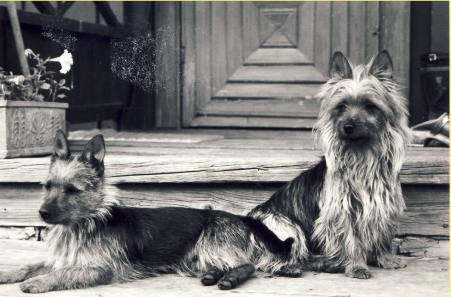
Two Dogs From Sweden In The 1980's

breeders in Sweden, Denmark and Finland and their line can be found behind lots of Aussies today. In 1987 Anne-Marie came back to Sweden with the male puppy Tahee Night Hawk and the bitch Ch Tahee Special Girl. They produced a litter in Sweden and again the puppies were sold to breeders in the Nordic countries. The only bitch puppy was Ymsens Yarrowonga, who was one of the foundation bitches at kennel Twee-Dle-Dee.