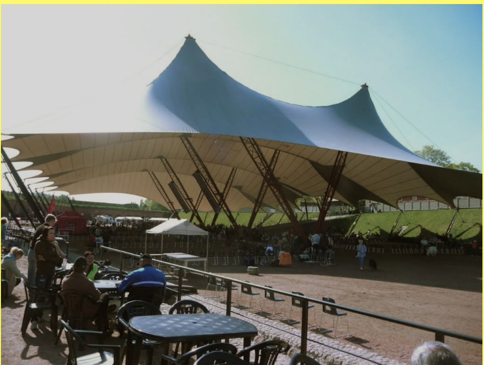
Show Site Sunday