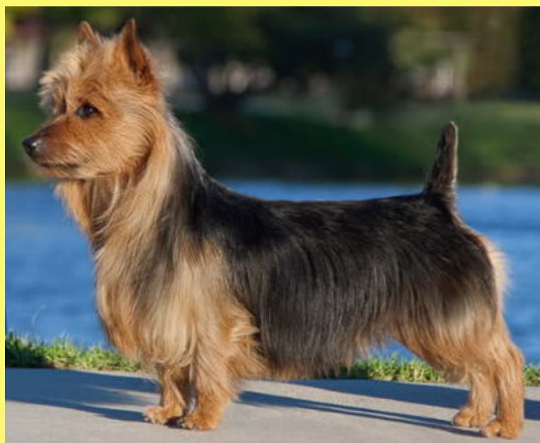
3 GCH CH Black Back Firefly "Ringo"