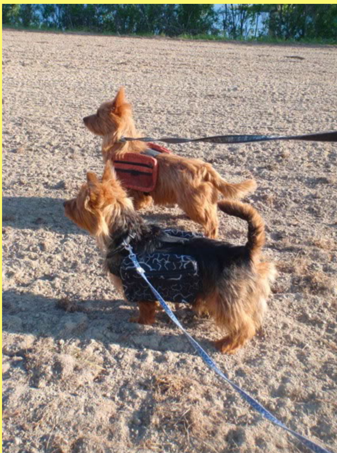
Vitterklippens Myran and Vitterklippens Lindy-Sue