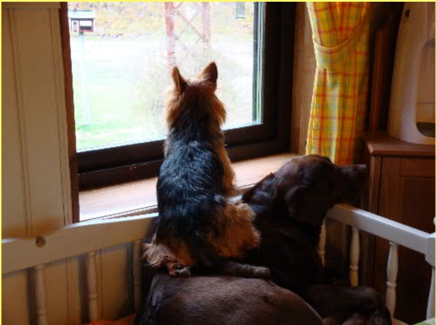
Ch Twee-Dle-Dee With Makeup On is using our Labrador to get a better view through the window.

My Aussies ARE my life. I live with them and sleep with them and they are my first priority all the time. I am surrounded by them all the time at home. Because of them I get to meet a lot of interesting people and go to a lot of places for shows. To watch the dogs interact with each other, play and do crazy things is so amusing, and to experience the very special bond between me and the dogs is priceless.