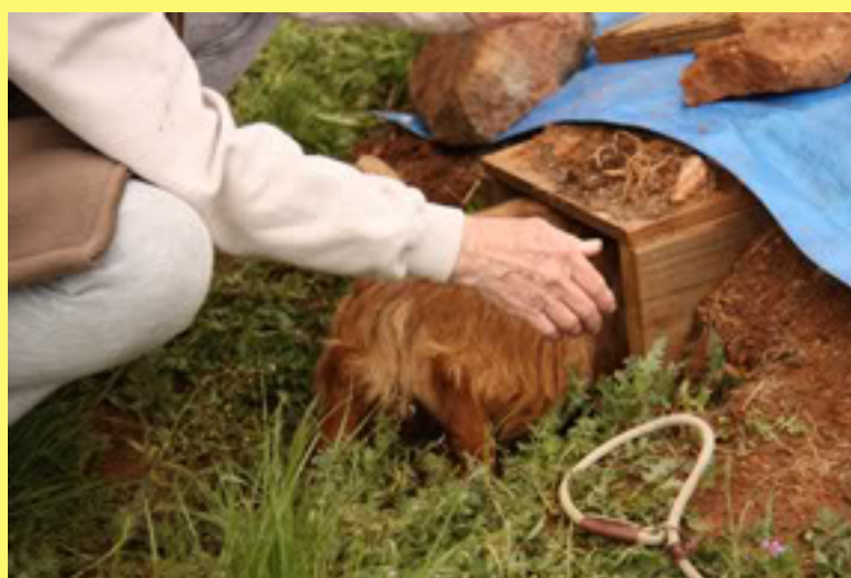
Learning how to do earth dog.