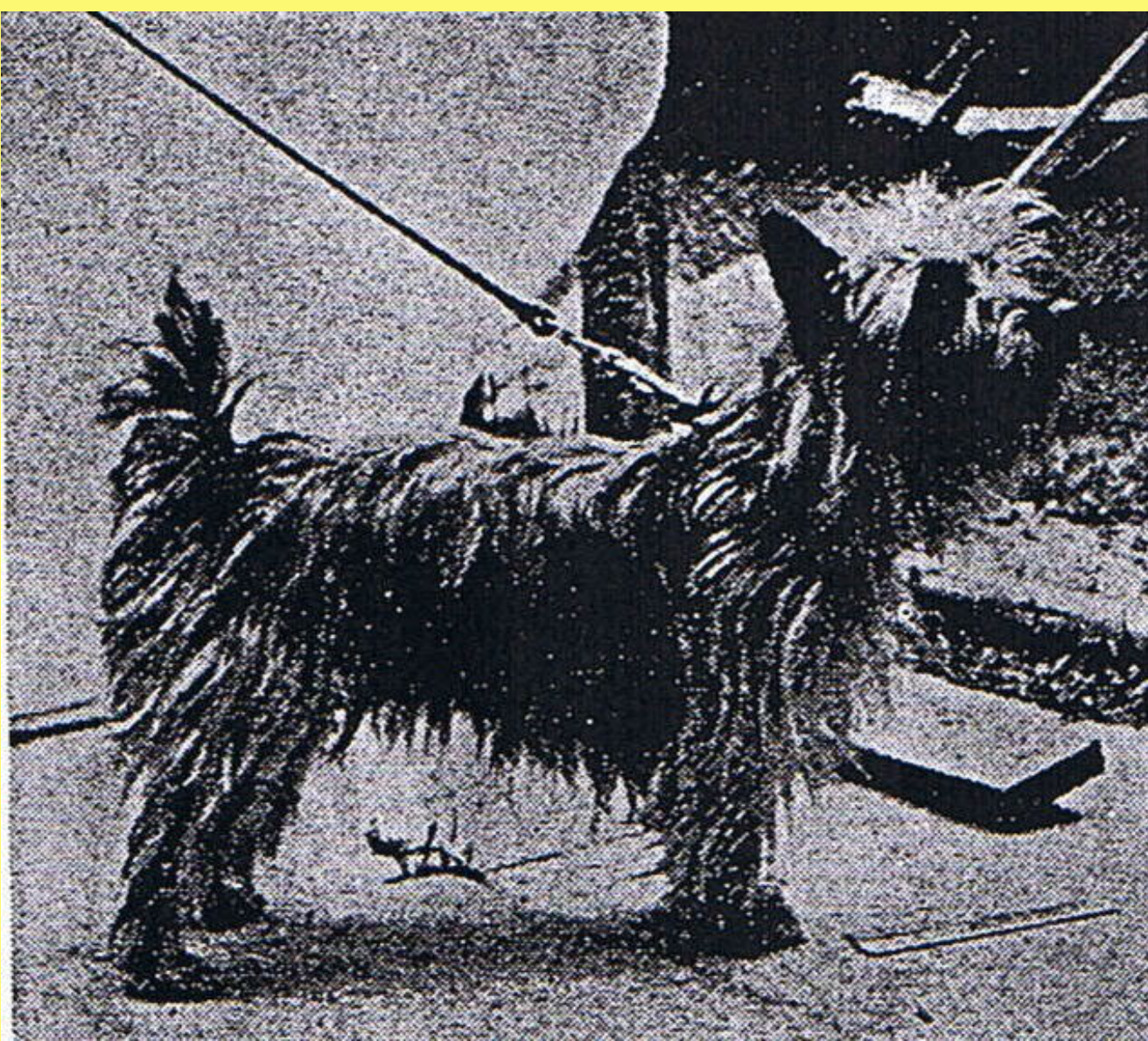
Stella Polaris Stardust