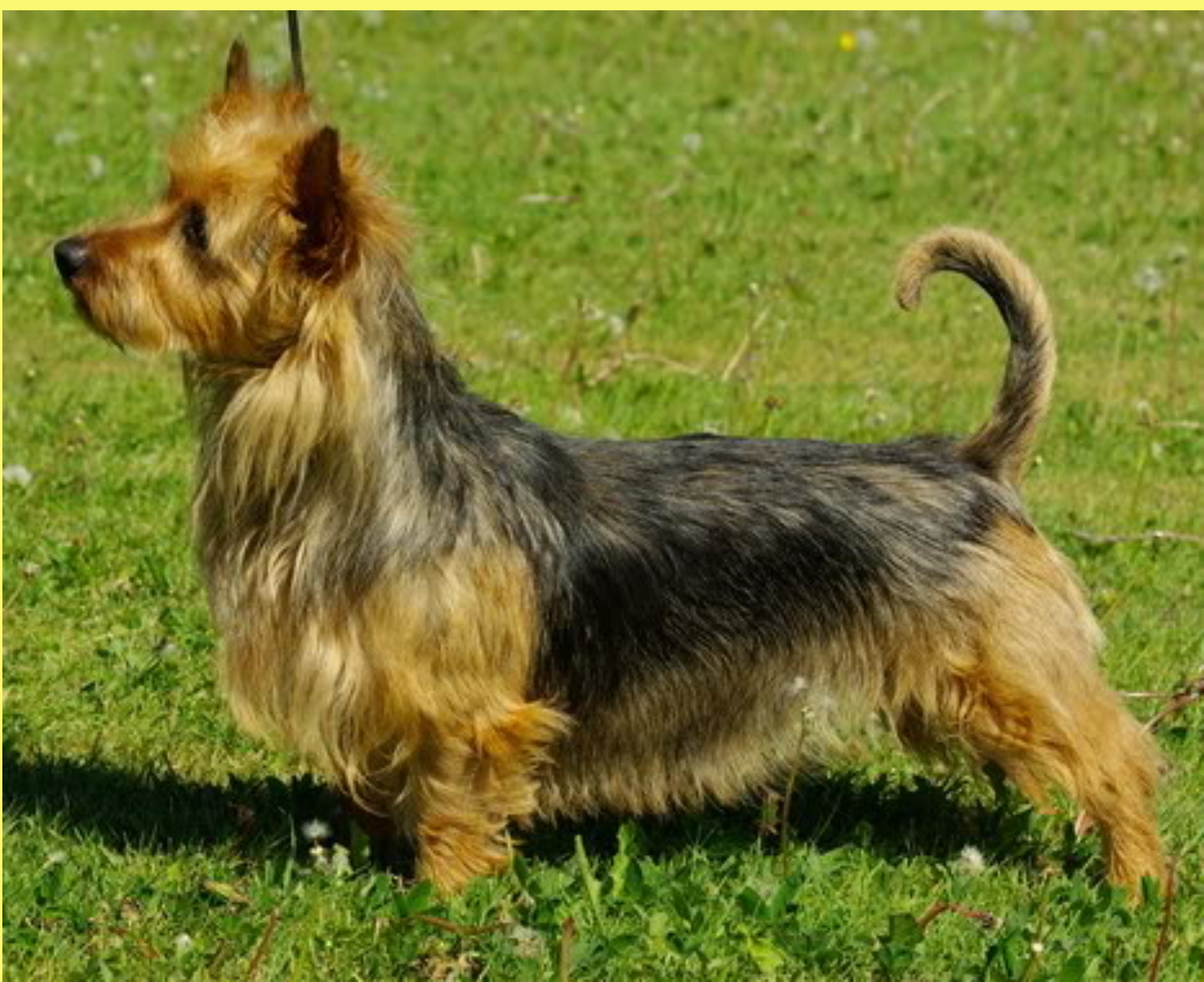
NO UCH SE UCH Ålhammarens Ruzzin